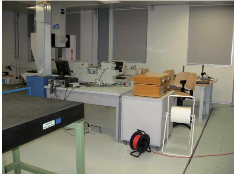
Calibration and measurement platform with instruments

As early as the planning stage for the test room for instrument certification, it was clear to the building owners that all