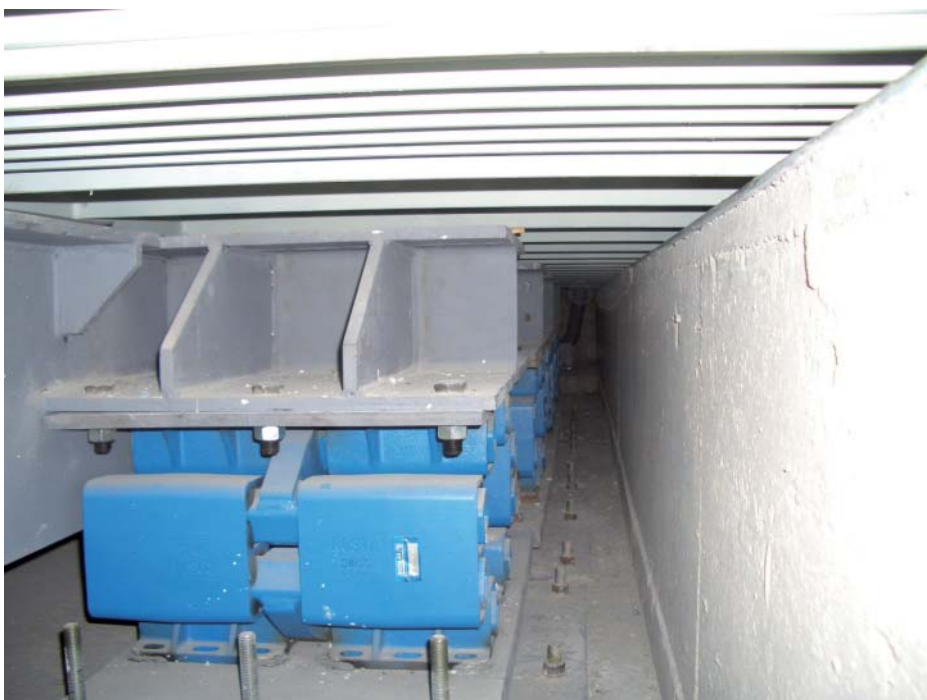
Base plate staying on ROSTA AB 50-2 TWIN mounts