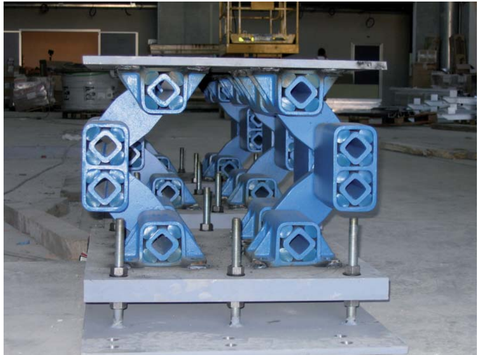
Nivelling „Sandwich-Plates“, each with 2 AB 50-2 TWIN supports