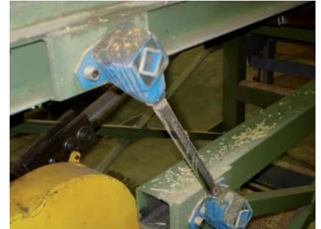
New rocker arms consisting of two AU 18 oscillating mounts

The matchstick vibrating conveyor from the year 1934, which has a slider-crank drive and a steel-leaf-spring suspension, has been running almost fault-free for 74 years in three-shift operation, although the leaf spring plates break relatively often due to material fatigue, which leads to production stoppages. Even though he was very fond of the 74-year-old machine, having to accept a loss of around two hours in each case was too much for the traditionally-minded Opera-