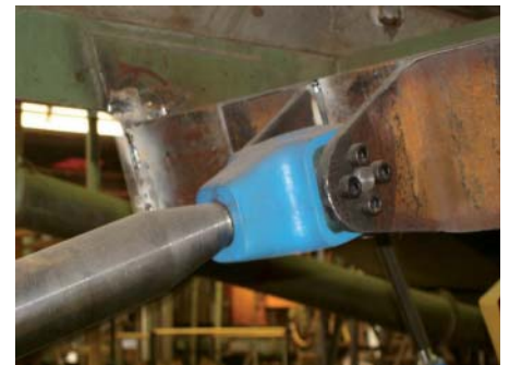
New drive-head system with ST 27