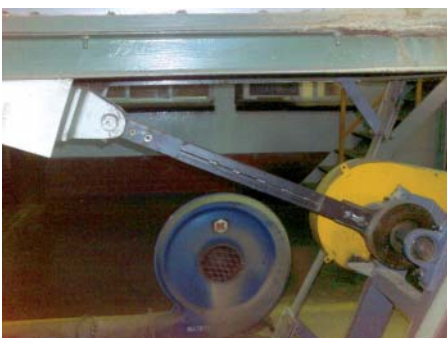
Former drive-head with ball bearing transmission

Within a few hours, the vibrating conveyor had been converted from leaf-spring suspension to ROSTA rocker arms, each consisting of two Type AU 18 oscillating mountings. The service mechanic also replaced the ball bearings of the slider crank drive, which were also susceptible to breakdown, with a Type ST 27 drive head from ROSTA. The „Oldtimer“ has now been running again in three shifts without any loss of production since May 2008 – and it will stay that way for at least the next ten years – silent, maintenance-free, dampened and operationally reliable.