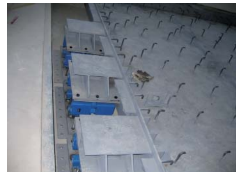
Base plate: 6 x 9 metre, Weight: 36 tons, supported on 28 pcs. AB 50-2 TWIN

support elements. The height of the lower „sandwich“ plate of the support can be adjusted using six adjusting screws in order to compensate for the initial settling of the rubber suspension units. In this „static“ application, an initial settling of approx. 10 mm will take place over a few months.