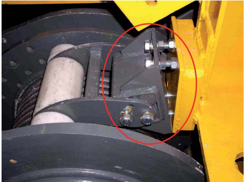
Guide roller equipment with ROSTA tensioning element

individual strands break away at the pinch locations due to the deformation tension that arises, and the whole, wonderful rope has to be replaced.