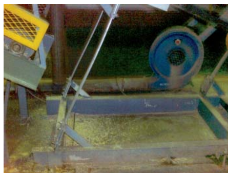
Former steel leaf-springs as shaker support