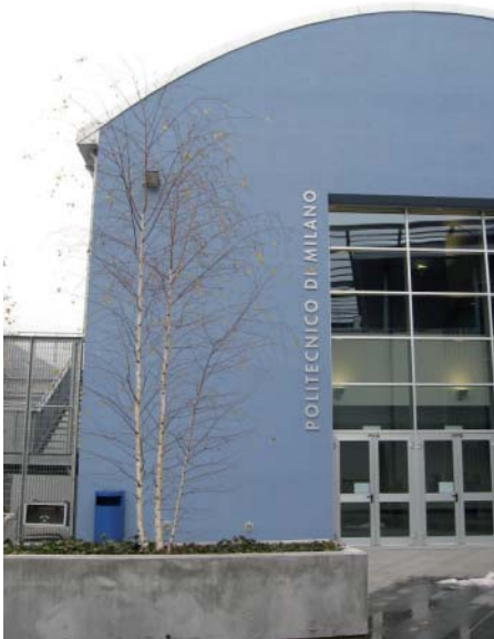
Polytechnic of Milan at IT-Bovisio

A few weeks ago, the new Polytechnic of the City of Milan started its operations in the Milanese suburb of Bovisio. The main North/South access lines of the railway pass through Bovisio, as well as two very busy motorway access roads. In addition, there are two large gantry cranes in the immediate vicinity of the Polytechnic, which broadcast vibration emissions through the ground.