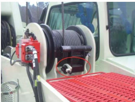
Crane winch with ROSTA guide roller

Their construction is robust and their function is guaranteed at all times by well-proven mechanical or hydraulic systems. The weak point in cable winches is the service life of the winch cables themselves. As a result of incorrect winding and unwinding, the steel ropes, which are subject to large tensile forces, can often become crossed, which crushes the structure of the twisted rope and the core of the rope, and thereby permanently deforms them. Within a short operating period,